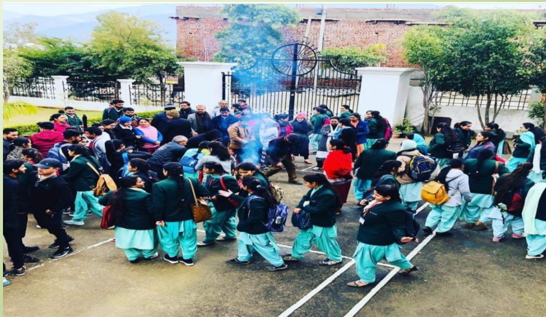
70 th Anniversary of Constitution Day Celebration 26-11-2019